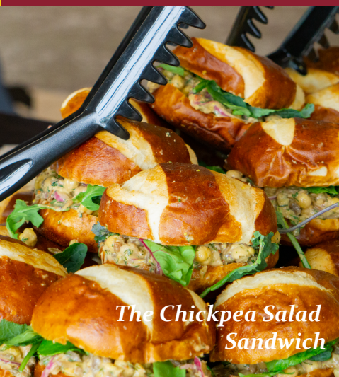
The Chickpea Salad Sandwich