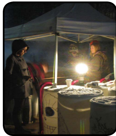
Students evaporate maple syrup late into the night outside van Reken hall.