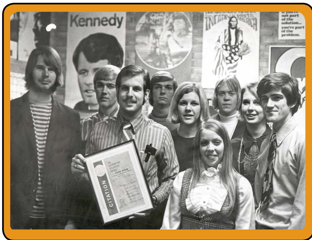
November 14th, 1970, KIDS received “The Outstanding Volunteer Award” from The State of Michigan.