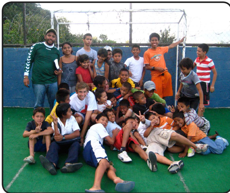
Calvin students in Honduras served and learned by running a week long soccer camp.

Throughout the summer I engaged in conversations with faculty and students, hearing how they have attempted to improve the learning experience for students. I learned of the eye-opening opportunities