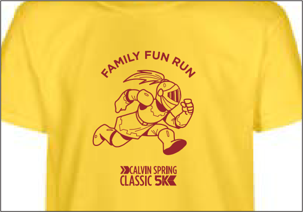
Family Fun Run front