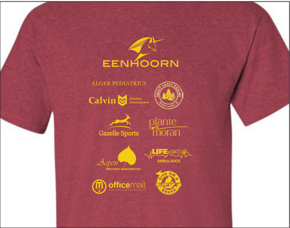
Sponsor logos on back