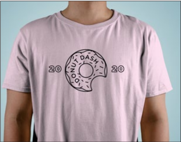
Donut Dash event