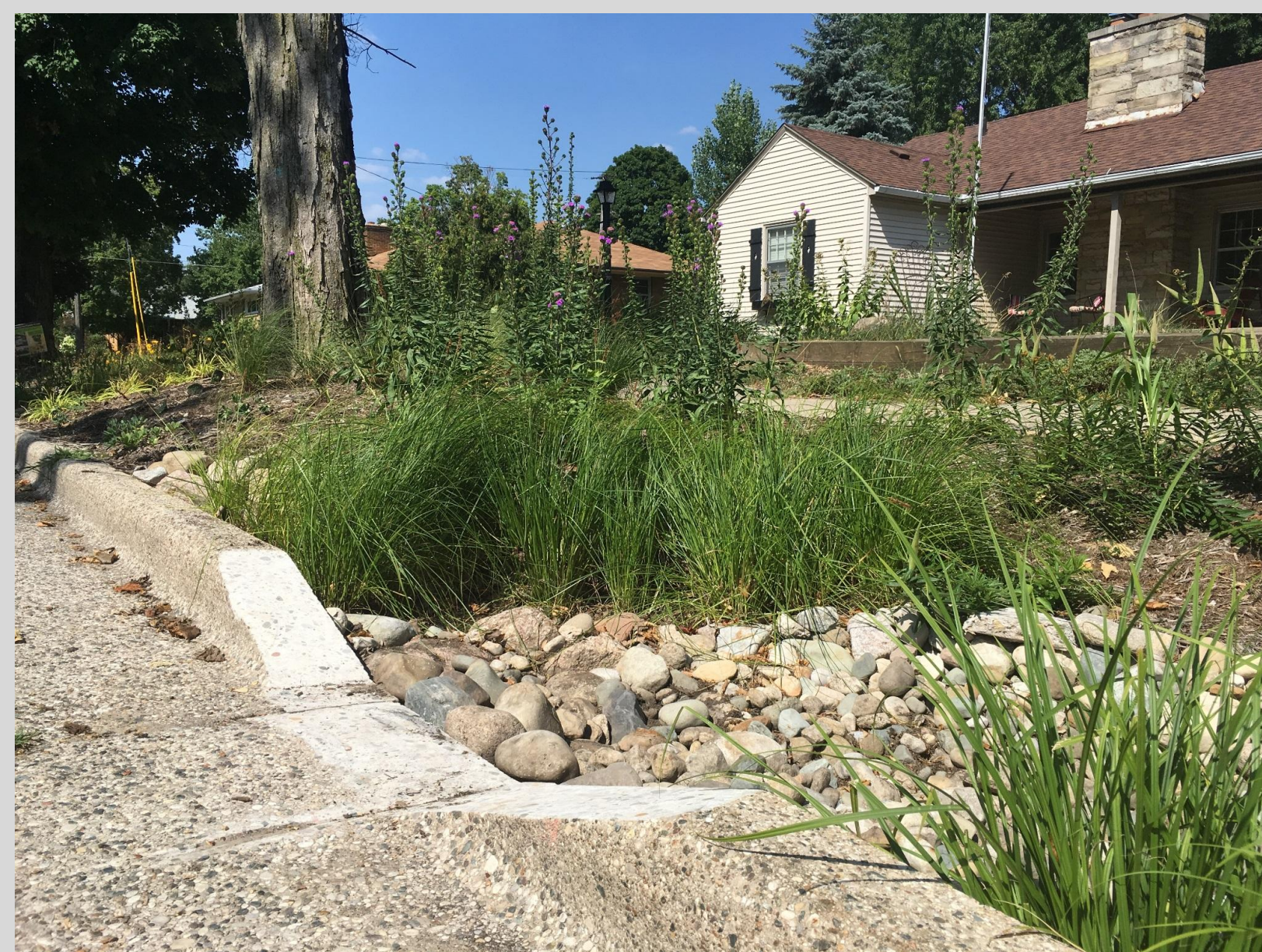
Figure 1: The curb cut of a two year old rain garden on Linden Ave. in Alger Heights, MI