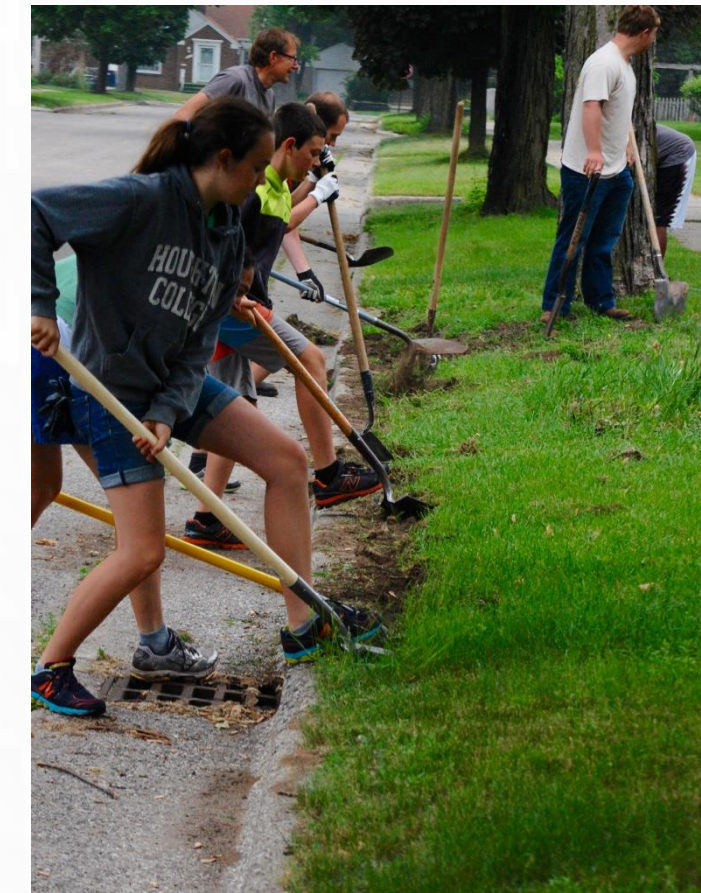
A community effort to remove sod.