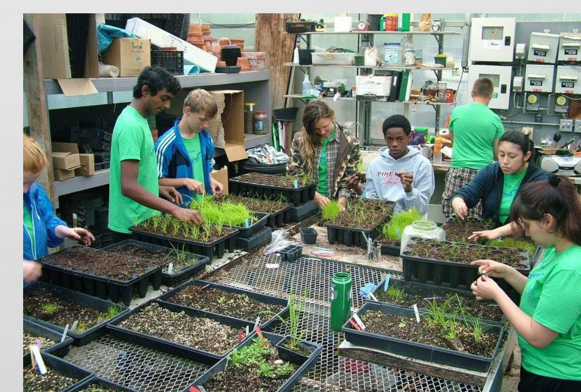
A team of local high school and college students work together to transplant seedlings into plug flats.

The plants used in the rain gardens are all native to the Grand Rapids area and carefully chosen to fit the microhabitats. These specific planting plans ensure optimal survivorship. For example, we commonly use Iris virginica in wet areas while we plant Asclepias tuberosa drier locations. We collect seeds from throughout the Grand Rapids area and grow the plants in our greenhouse.