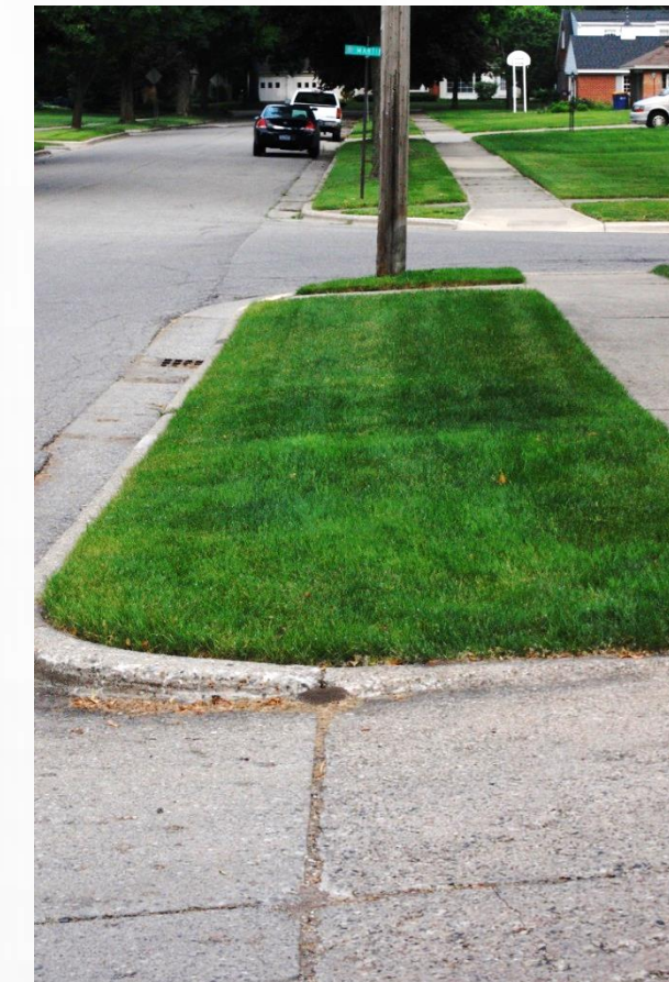
Original grassy parkway.