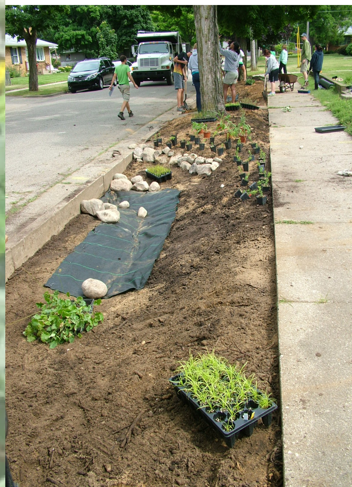
Curb cut rain garden installation

To understand where and what types of BMPs are most needed, a hydrologic model is necessary. The model is also able to measure BMP effectiveness which aids in future BMP implementation.