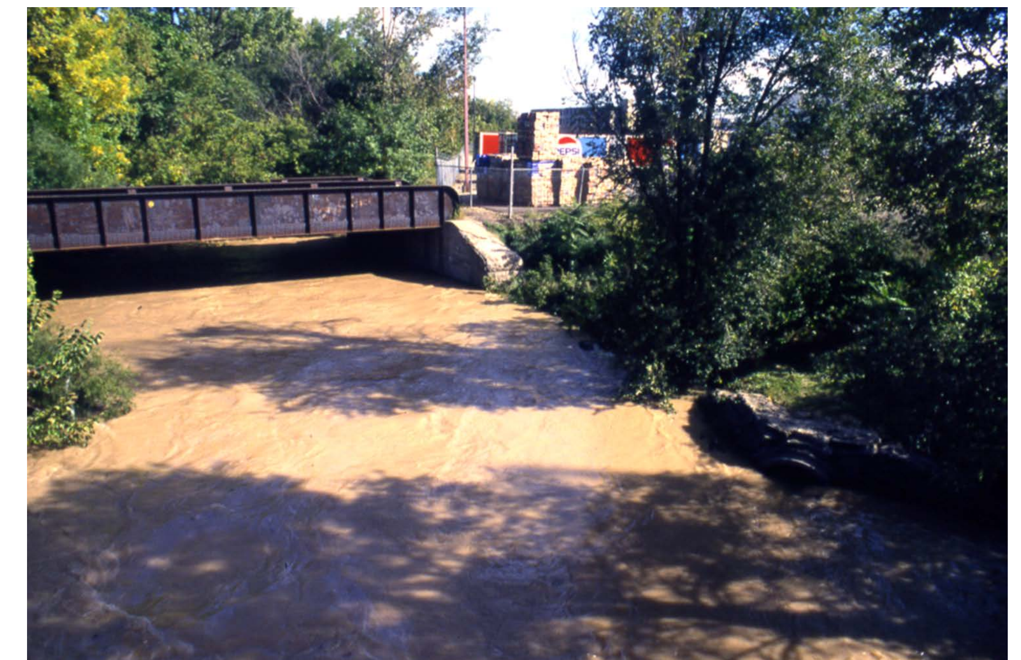
Plaster Creek after a rain event