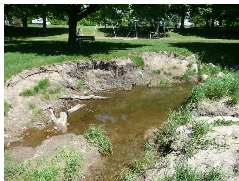
Stream bank erosion

The model was developed in HEC-HMS, a program designed by the Army Corps of Engineers to simulate how watersheds react to storms. To gather the information needed for HEC-HMS, we worked with other programs including GIS (a mapping software) and HY-8 (a culvert analysis software).