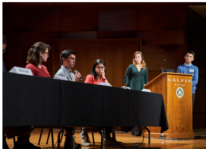
Religious Minority Students on a Christian Campus Panel