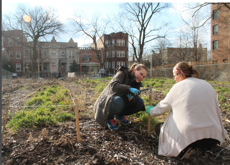
Spring Break Trip: Chicago, IL 2019