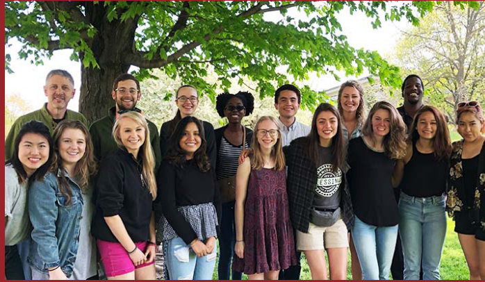
Above: 2018-2019 S-LC Staff

Our mission is to engage and equip Calvin University students, faculty, staff, community partners, alumni, and other friends of the university in and for the pursuit of God's shalom in learning together, primarily through community-based service-learning, social justice activity, and civil participation in Grand Rapids and other partner communities.