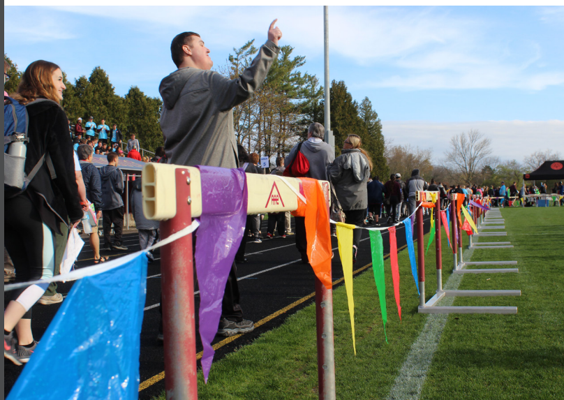
Special Olympics 2019

International ABSL (ISL) is service-learning formally integrated into study abroad course experiences.