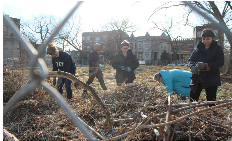
Spring Break Trip: Chicago, IL 2019