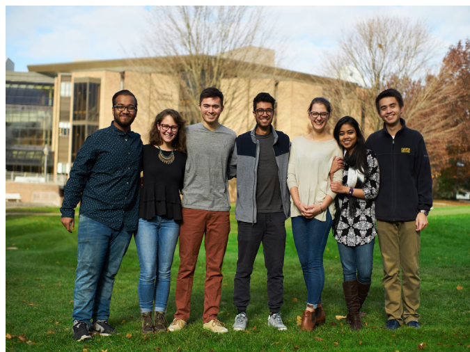
Calvin Interfaith Alliance Student Leaders