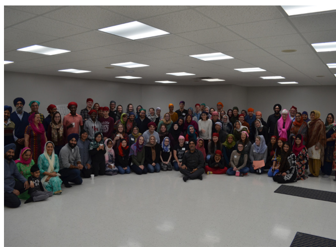
Sikh Gurdwara Site Visit & Dinner