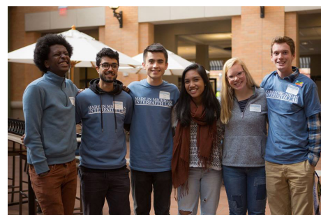
Calvin students at GVSU's Interfaith Lab (MIMIL)

The S-LC, in partnership with Kaufman Interfaith Institute, has incorporated interfaith cooperation into our work through the facilitation of panels and events and has sent various Calvin students to interfaith conferences held by the Interfaith Youth Core. During the past two years, interfaith work on campus has grown, the most notable development being the establishment of the Calvin Interfaith Alliance (CIA) as an official student organization this year, led by Calvin students and assisted by the S-LC Interfaith Coordinator.