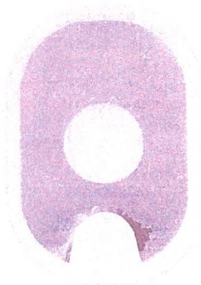
Figure 3: Gel almost completely separated from backing.

Action: Apply pads to the patient. Do not hesitate.