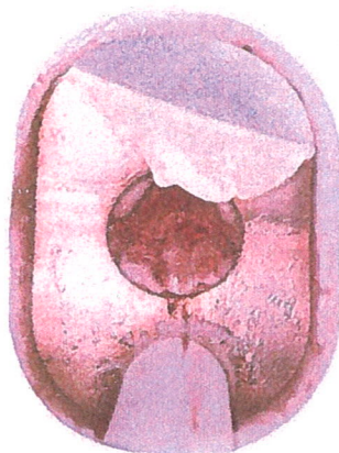
Figure 2: Separated, folded gel may also have a discolored and/or melted appearance.

Action: Apply pads to the patient. Do not hesitate.