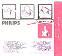
M5071A foil packaging

The M5071A and M5072A part numbers are located on the pads cartridge and the foil packaging. The M5072A identifier can also be found on the box that Infant/Child pads are shipped in. See photos below with the location of the part number circled.