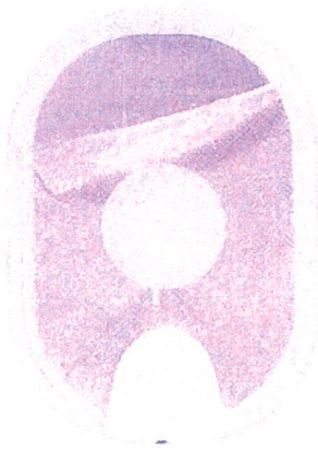
Figure 1: Separated gel that has folded onto itself when peeled.

It is also possible that the gel could separate almost completely from the foam/tin backing when peeled, (see Figure 3 .) Due to a small amount of gel surface contact area with the skin, electrical arcing could occur when a shock is delivered leading to burns to the patient’s skin, or the AED could be unable to deliver any shock through the pads. A delay in therapy will result while the user installs a replacement pads cartridge (if available) or performs CPR while waiting for Emergency Medical Services Personnel to arrive. For comparison, Figure 4 shows a normal pad. No matter the state of the pad, follow the voice prompts because the AED will step you through the necessary actions.