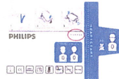
M5072A foil packaging