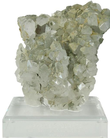
Pyrite with Quartz OR30