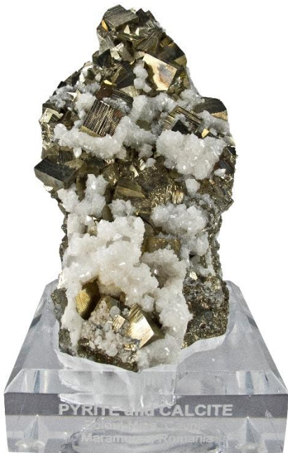
Pyrite and Calcite R2