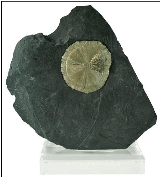
Pyrite Dollar in Shale OR28

Pyrite, also known by its informal name “fool’s gold,” is derived from the Greek word pyr , meaning “fire” because when pyrite is struck by iron it emits a spark. Although much lighter and brassier in color than gold, pyrite has been mistaken as gold by novice prospectors for hundreds of years. Pyrite crystals most often form as cubes, but octahedron and pyritohedron (also known as pentagonal dodecahedron) crystals are also common. Pyrite is found in sedimentary rocks, such as shale, coal, and limestone. The pyrite “sun” or “dollar” forms when growth is restricted between tightly spaced layers of shale, causing it to grow in a laterally compressed and radiating manner. OR28