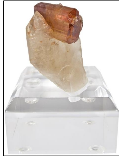
Tourmaline var. Liddicoatite B17