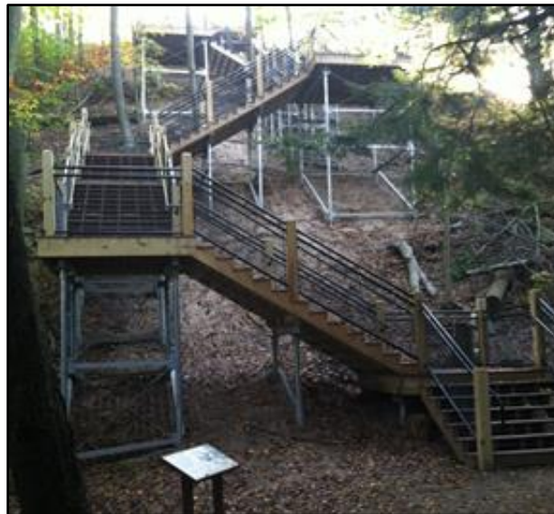
Figure 2: The Dune Climb boardwalk section after rebuilding in 2016.