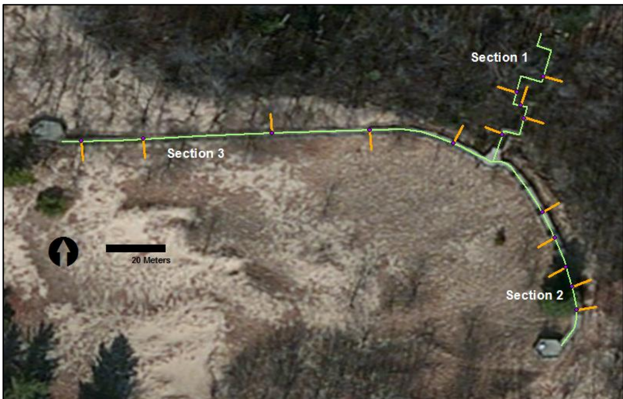
Figure 3: Transects (orange) extending from randomly-selected locations along the boardwalk.

To measure vegetation characteristics, transects perpendicular to the boardwalk were established at randomly-selected locations along the boardwalk (Figure 3). We entered the boardwalk length, in meters, into a random number generator to choose five distances from the center viewing platform at which to place transects. For example, section 3 of the boardwalk is 89 meters long, so we used the random number generator to choose 5 numbers between 1 and 89.