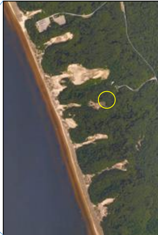
Figure 1: Location of P.J. Hoffmaster State Park in Michigan. The boardwalk location is circled on the aerial image of the park.