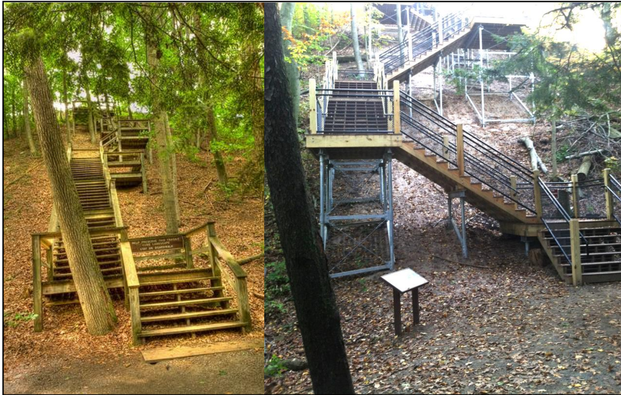
Figure 5: Old boardwalk (left) and new boardwalk (right). Note the changes in tree cover, with cut trees visible to the right in the photograph of the new boardwalk.