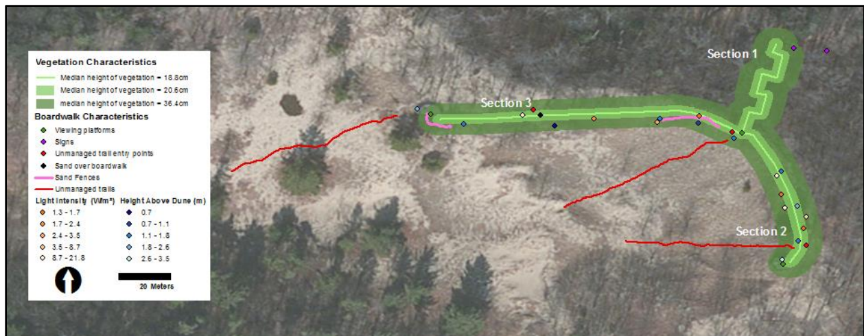
Figure 4: Mapped boardwalk and features in the study area. Vegetation at 0, 1, and 5 meters from the boardwalk is shown in green.

Signage and barriers on the older parts of the boardwalk are scarce. The section with greater average height above the ground, section 2, has a higher light intensity beneath it (Table 2). There is a portion of section 3 which is so close to the dune surface that sand is sitting on the walking surface. Also along section 3, there are some sand fences that are placed along the side of the boardwalk. Upon comparing the older dune climb with the new one, we noticed much improved accessibility through design. Namely, the new Dune Climb has more even steps and improved handrails (Figure 5). It is also farther from the dune surface than the previous one.