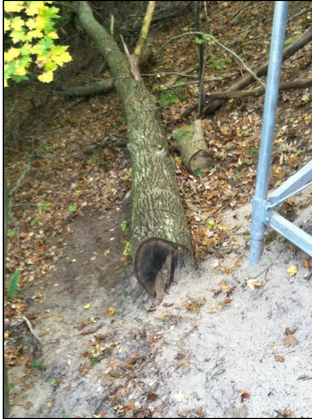
Figure 7: Recently-cut tree near new Dune Climb.