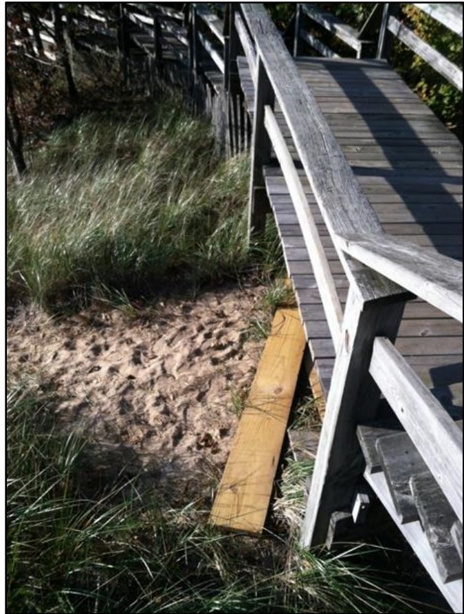
Figure 8: Unmanaged trail entry point, with leftover construction material visible.

the dune surface could be used if they are long enough. However, mesh similar to what is present on the Dune Climb would be more effective and more durable than horizontal wood boards.