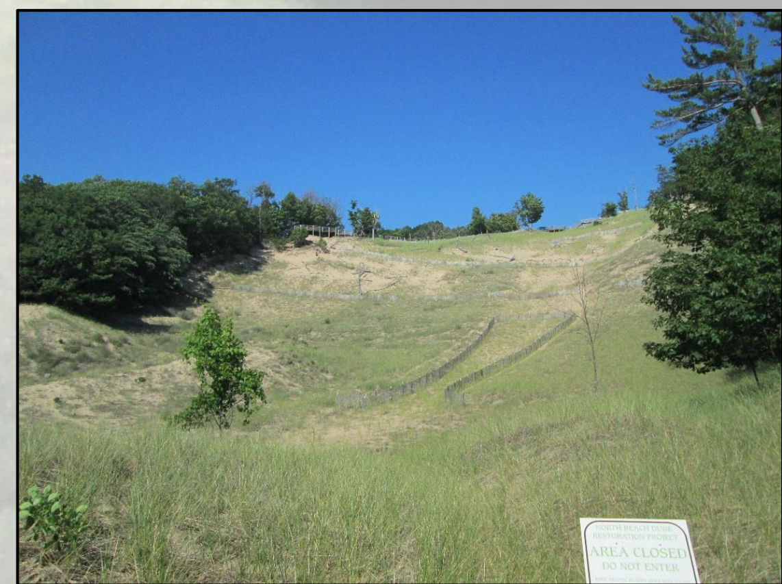
Figure 1: The windward slope of this dune is covered with planted A. breviligulata .