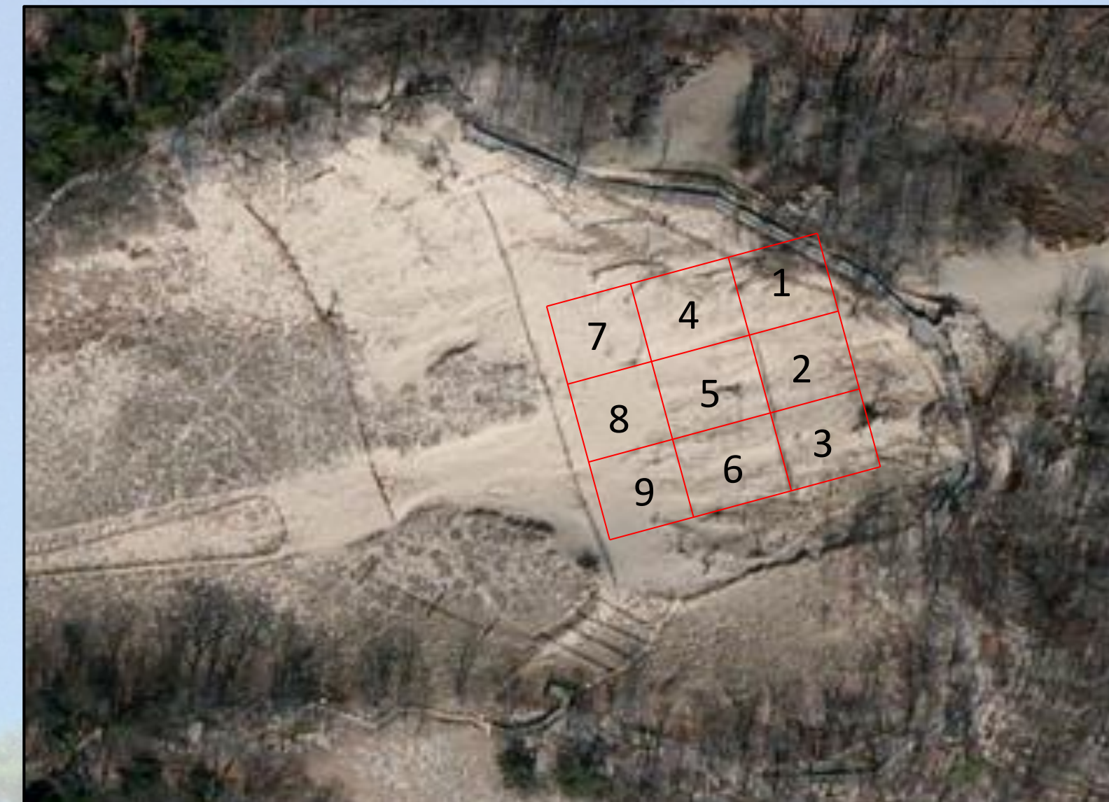
Figure 3: Study site with zones superimposed over the map.

We divided the study area into 9 zones (Figure 3) and sampled vegetation characteristics with 7 randomly placed quadrats in each zone (Figure 4). In each quadrat, we measured A. breviligulata height and health (Table 1) and observed other species. For each zone, we measured zone dimensions, estimated vegetation cover, and calculated dune slope. We compared photographs of the study site throughout the past 10 years to see how A. breviligulata had spread.