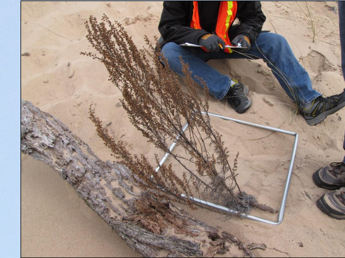
Figure 4: Researcher using .5 m x .5 m quadrat for sampling vegetation.