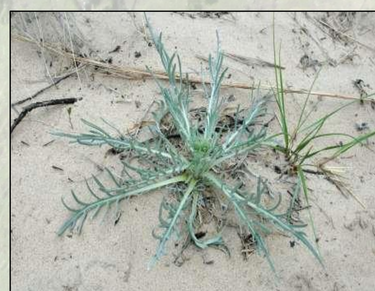
Figure 6: Cirsium pitcheri (Pitcher's Thistle) is a federally threatened species that was found in zone 5.

Our results show a weak positive relationship between dune slope angle and height of A. breviligulata (Figure 7). Grass near sand fences was taller and healthier than grasses in transition areas between bare sand and full vegetation.