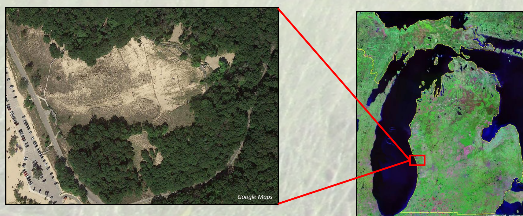
Figure 2: Location and aerial photograph of North Beach dune.

The study took place on the upper windward face and crest of North Beach dune, a large parabolic dune in Ferrysburg, Michigan (Figure 2). Ottawa County Parks initiated plantings of A. breviligulata between 2004 and 2014 to mitigate dune movement caused by human disturbances.