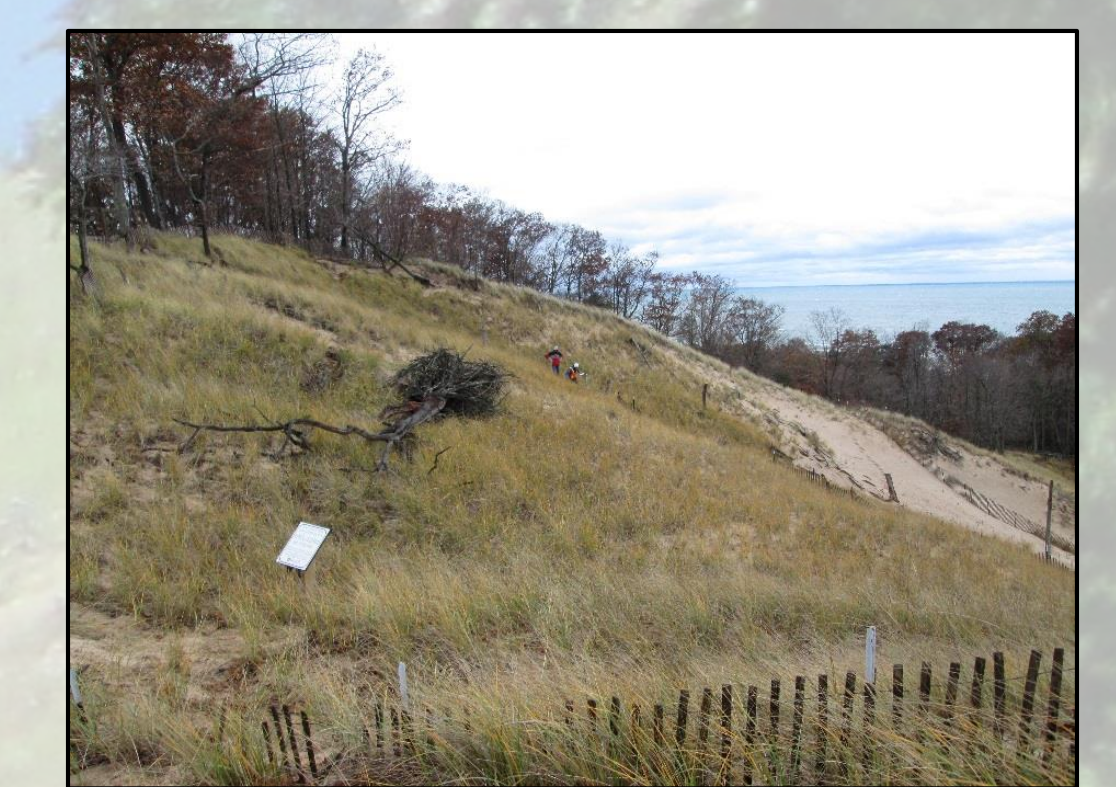
Figure 8: The vegetated upper slope of North Beach dune. The non-vegetated lower zones can be seen in the background.

Areas with steeper slopes have greater instability which enhances levels of disturbance from gravity or animal activity. The observed increase in A. breviligulata height on the steeper slopes may result from A. breviligulata thriving in areas of disturbance.