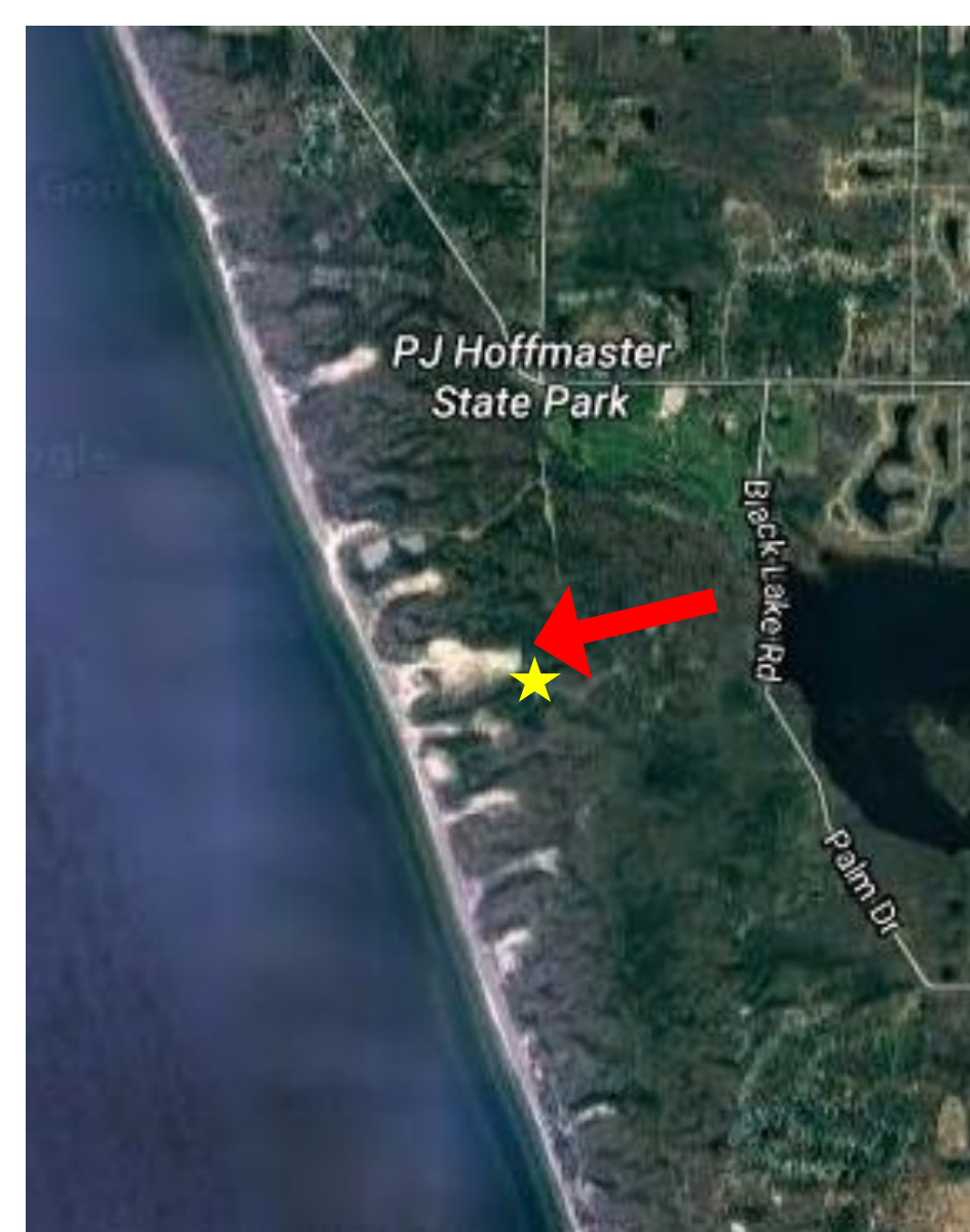
Figure 2 (right) Map of Hoffmaster State Park with a star over the visitor center and an arrow showing Mt. Baldy

The area of this study was a large coastal parabolic dune on the east coast of Lake Michigan (figure 1). Mt. Baldy is the largest dune in Hoffmaster State Park, located just northeast of the Visitor Center (figure 2).