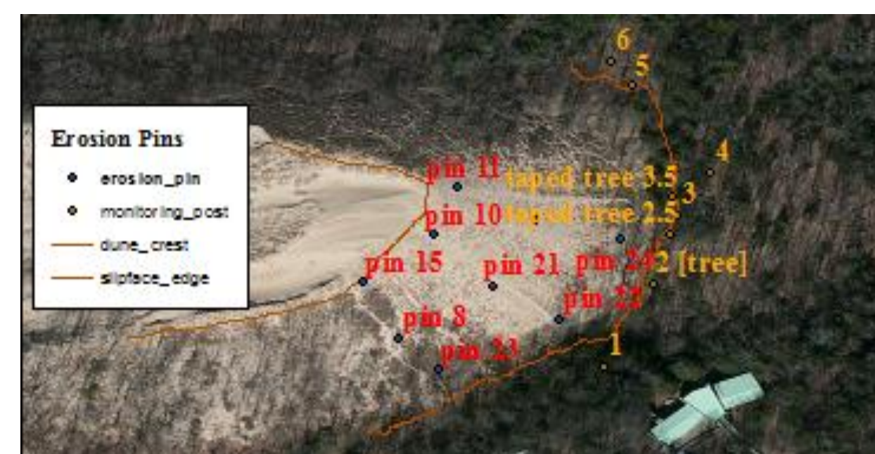
Figure 5. Erosion pin and monitoring post map

Vegetation differences were found at the differing pins (figure 5) including trees at pin numbers 8, 15, 22, 23, 24, sparse dune grass at pin 4, 8, 11, and 21, reed-like vegetation at pin 23, and denser grass at pins 10 and 15. The most deposition appears to be occurring in the sparse dune grass area where the dune is most active. This would correlate with a general movement of the dune to the northeast.