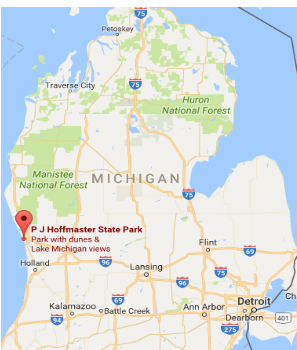
Figure 1 (left) Map of Michigan