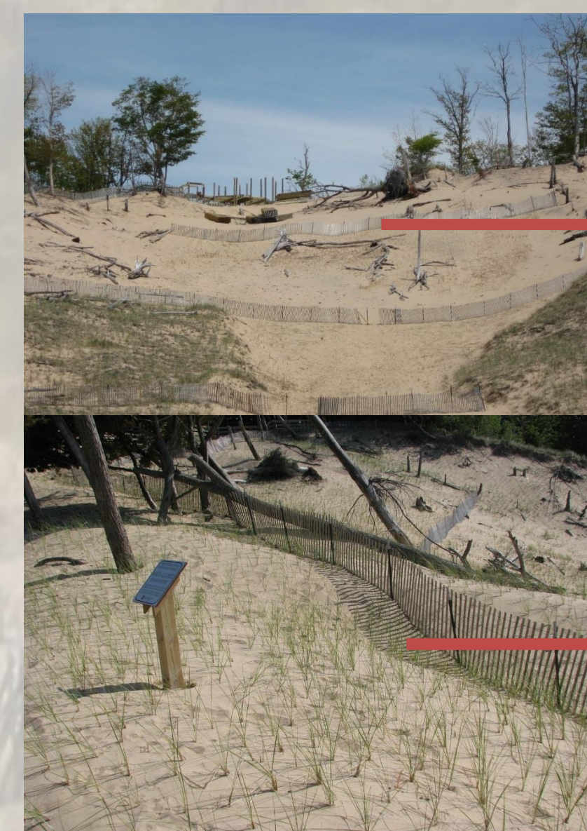
Figure 5 North Beach Dune in 2004 and 2009