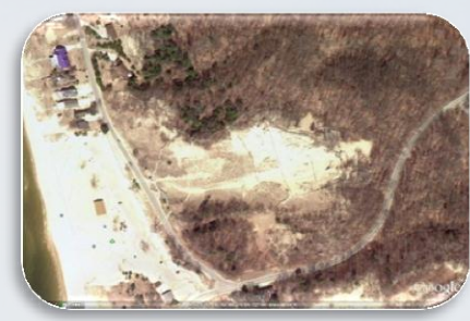
Fig 2. Changes and locations of the trails were monitored by aerial pictures

•By using aerial photography and satellite images we were able to determine the locations of unmanaged trails (Fig 2).