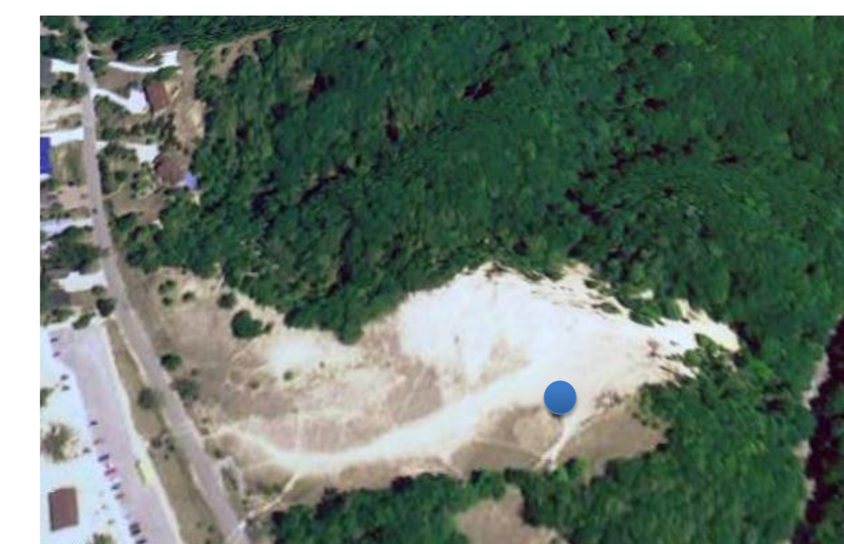
Fig 7. Aerial photo of North Beach Park Dune in 2005. *End of board walk is represented by blue dot.

The Southwest side of the dune is where the largest number of unmanaged trails are located. This area has been subjected to large amounts of trampling in the past. This is most likely due to the fact its location, near the base of the dune. But another likely reason for the large amounts of trampling to occur is that the boardwalk ended half way to the summit. This is a likely the reason that there was a lot of large unmanaged trails in the past (Fig 7). We also believe that because of the management efforts it has made a noticeable improvement in the amount and severity of unmanaged trails located on the dune.