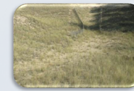
Fig 4. Example of a heavily vegetated trail

•We used two GPS units (Fig 3). One unit was used to record the perimeter of each trail. The other was used to take points at the beginning, middle, and end of each trail.