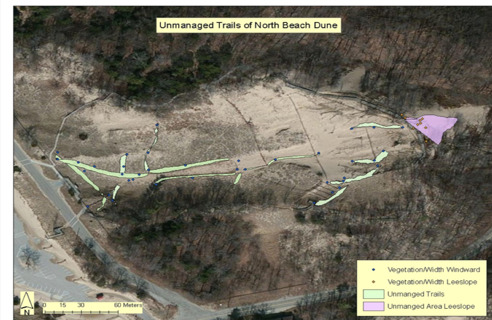
Fig 6. The perimeter of each unmanaged trail and the points where width and vegetation % was measured.