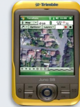
Fig 3. An example of a GPS system used

•By using aerial photography and satellite images we were able to determine the locations of unmanaged trails (Fig 2).