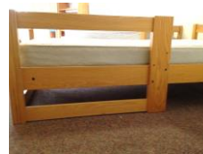
(a) Mattress is higher