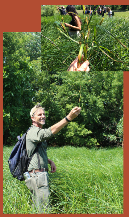
Finding Carex trichocarpa