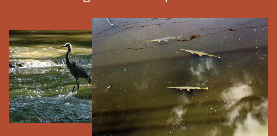
A heron and gar seen near the Grand River