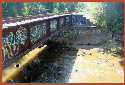
Railroad overpass downstream