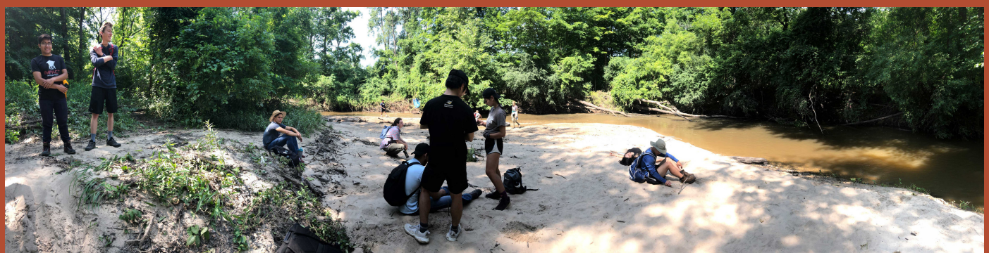
Taking a break on a midstream sandbank

On a classic West Michigan summer Friday morning, July 2, the PCS summer work crew and staff (16 people total) set off on a creek hike, starting at the bus stop on Calvin's campus enroute to Ken-O-Sha Park. Because hiking the entire stretch of Plaster Creek would likely require more than a single day, we planned out a more do-able 1-day hike from Ken-O-Sha School, to where Plaster Creek joins the Grand River and back to the downtown bus station. In terms of natural quality, we started out in one of the nicest sections of the watershed and walked downstream toward some of the most degraded sections.