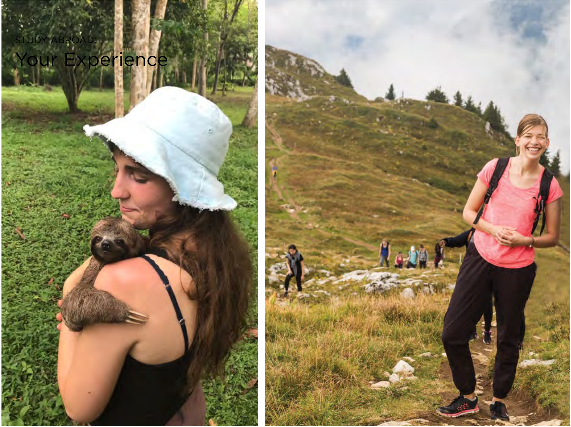
Calvin University study abroad photo guide