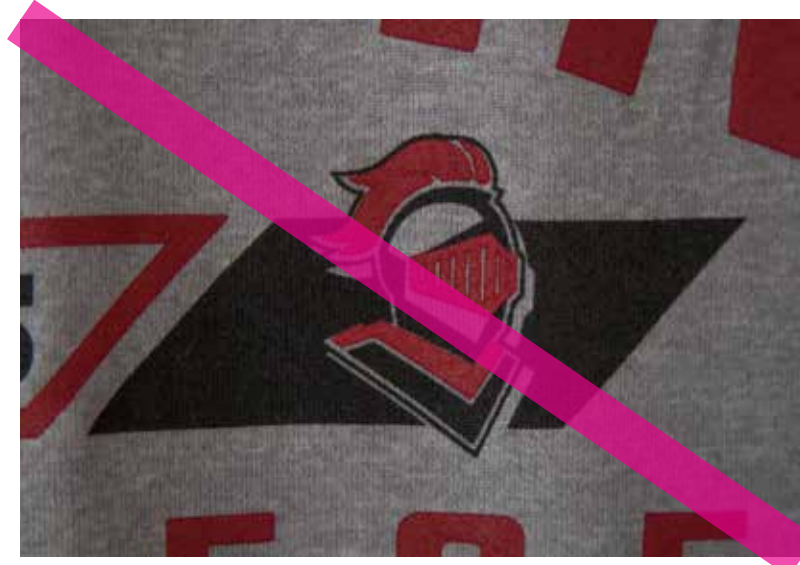
Do not alter the colors of the logo. Do not use unofficial colors or combinations.