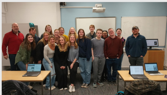
Calvin Students in Liverpool