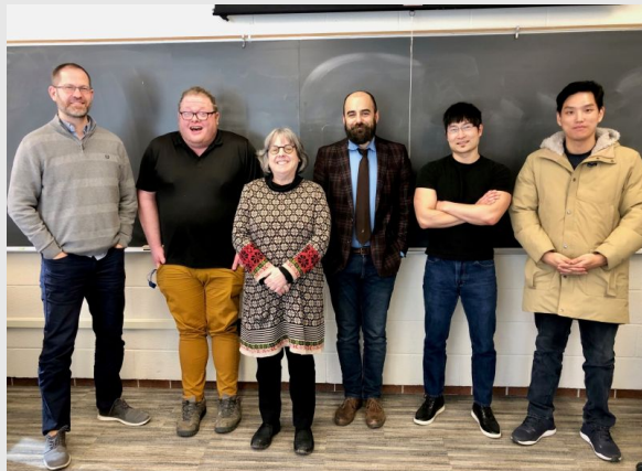
Academic Publishing Workshop