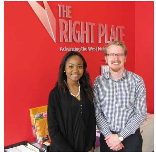
Zee - The Right Place