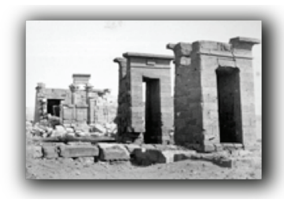
Temple of Debod in Egypt before relocation to Spain

Many of you already hold tickets for the Passport to Adventure Series sponsored by CALL. The photograph on the cover of this guide suggests that this curriculum guide provides some additional doorways to adventure. The pictured temple was originally located about 10 miles south of the city of Aswan in Upper Egypt. In 1960, due to the construction of the Aswan High Dam and the consequent threat posed by its reservoir to numerous monuments and archeological sites, UNESCO made an international call to save this rich historical legacy. As a sign of gratitude for the help provided by Spain in saving the Abu Simbel temples, the Egyptian state donated the temple of Debod to Spain in 1968.