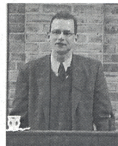
Professor Otto Selles

Pastor Antoine Court (1695–1760) was a leading figure in the Church of the Desert—the underground Reformed assemblies that met in the French countryside ( au Désert ) after the Revocation of the Edict of Nantes in 1685. From 1715 to 1729 Court played an essential role in organizing these disparate assemblies and in encouraging a policy of nonviolent resistance.