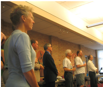
NEH Participants at opening reception

supervisor), the participants swiftly became a strong and cohesive group, thanks in part to shared experiences including finding their way around campus, trying to locate more comfy chairs for class