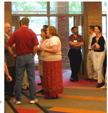
Participants getting to know one another