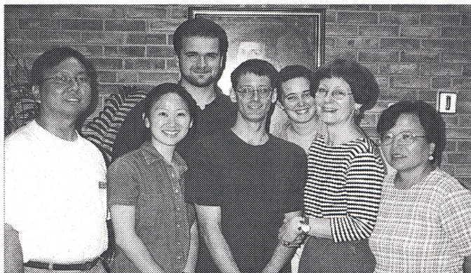
Genevan paleography class