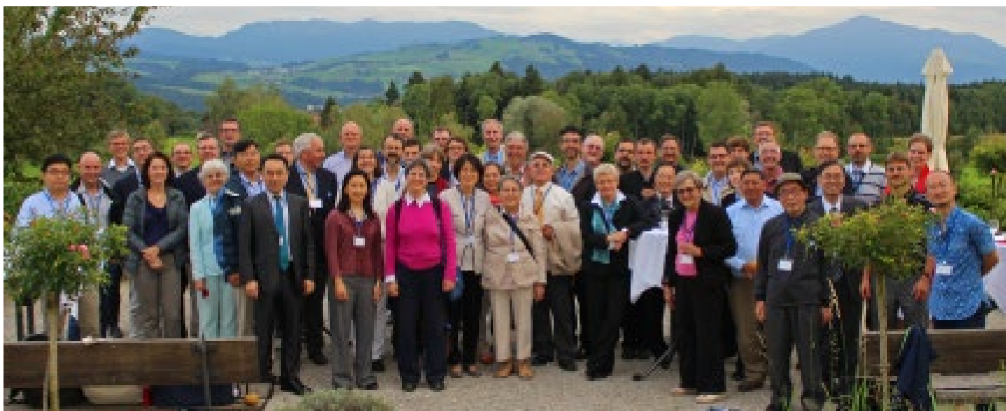
Participants of the 2014 International Calvin Congress in Zurich