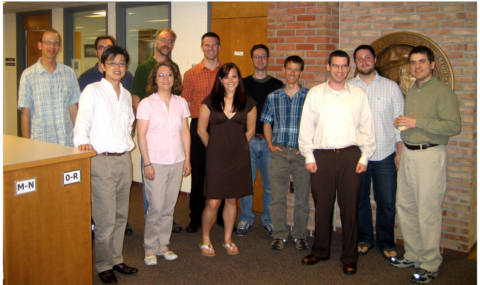
2008 Paleography Course Participants