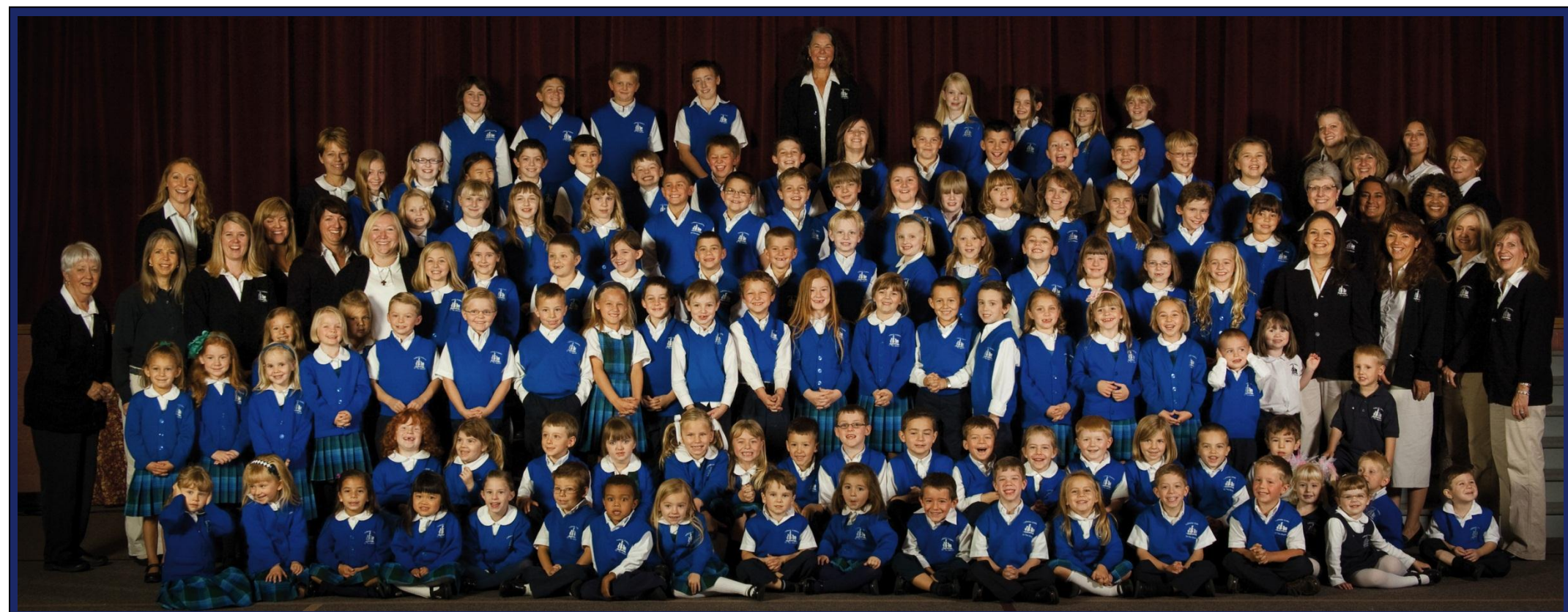
LAM staff and student body 2011 - 2012

School needs to have long term control of facilities for growth and stability