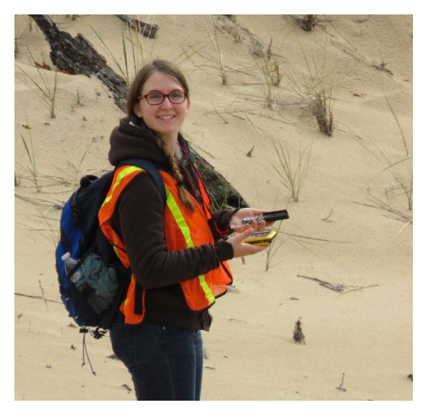
others who live there.