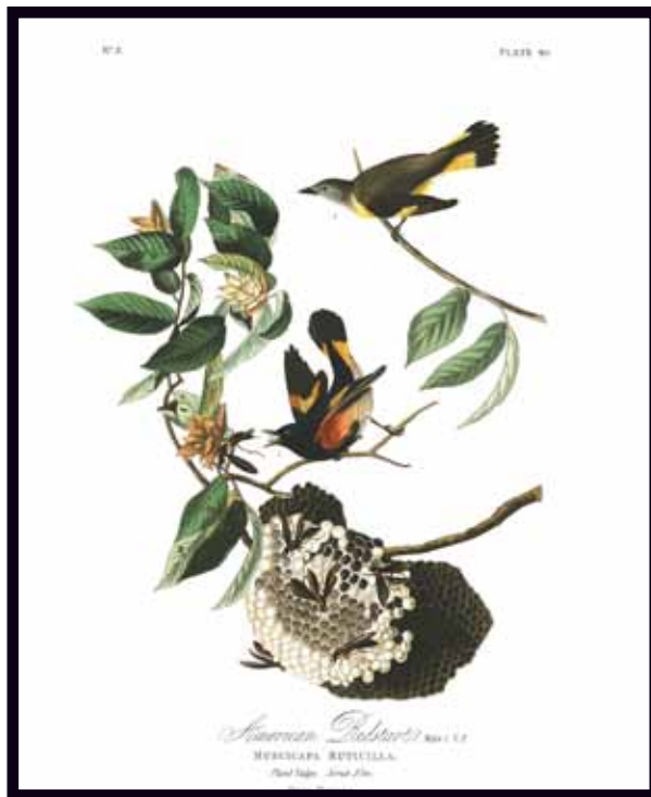
John James Audubon