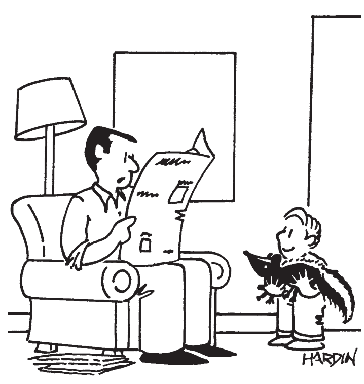
"It's O.K. by me. Ask your mom."